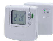
DT92E Digital Thermostat