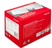
Sundial RF 2 Pack 3 & Pack 5