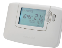
CM700 and CM900 Programmable Thermostat range (CM721; CM727 and CM921; CM927)