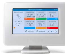
Evohome controller (ATP921R3100)